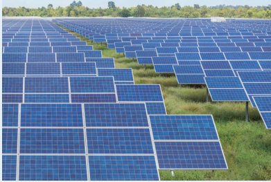
Solar battery, Fuel cell

For electrode protection, sintering aids to ceramic and metallic powder, hermetically sealing and various purpose glass