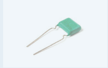
Sensor (Thermistor, Fuse, Varistor)